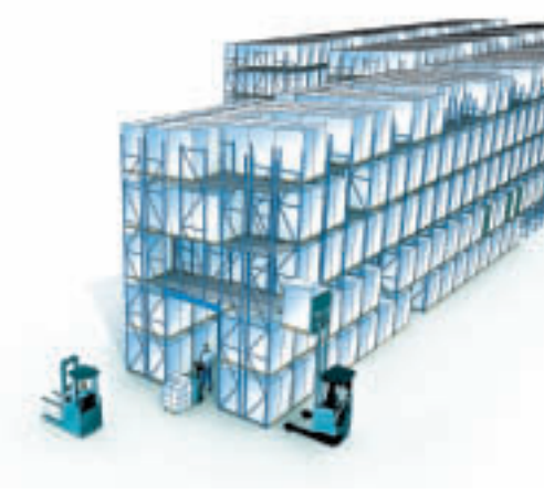
Patent pending: new wear-resistant Speed Controller for even highe throughput in pallet flow storage