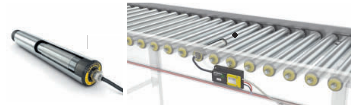
New generation: new drive solution with RollerDrives, conveyor rollers driven via V-belt and decentralised intelligent control modules

Interroll succeeded in further improving customer value in the period under review thanks to the technical enhancement of products; new designs have also made products easier to install and more user friendly. As the iF Product Design Award 2011 and other distinctions and certificates have shown, the market is increasingly coming to regard Interroll as an innovation partner in the field of internal logistics. Alongside innovation, Interroll also pushed ahead with strategic projects such as the implementation of SAP during the reporting period.