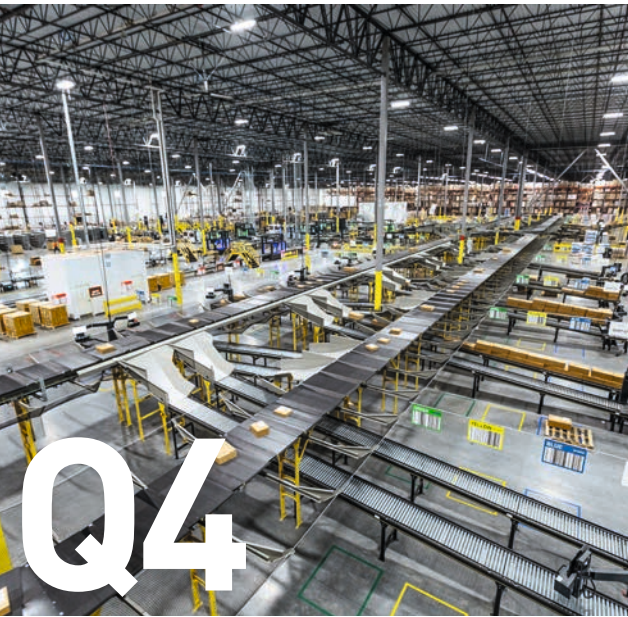
THE PARTNERSHIP WITH OUR ROI PARTNERS

In 2022, we began our global migration from SAP ECC 6.0 to SAP S/4HANA, which will enable us to make significant improvements in productivity. In parallel, we are working on harmonizing and standardizing data. SAP S/4HANA was deployed at the same time at all the Interroll sites in February 2024.